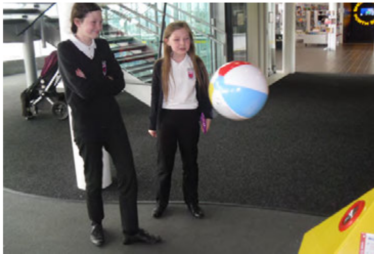
Image: Fun with the beach ball