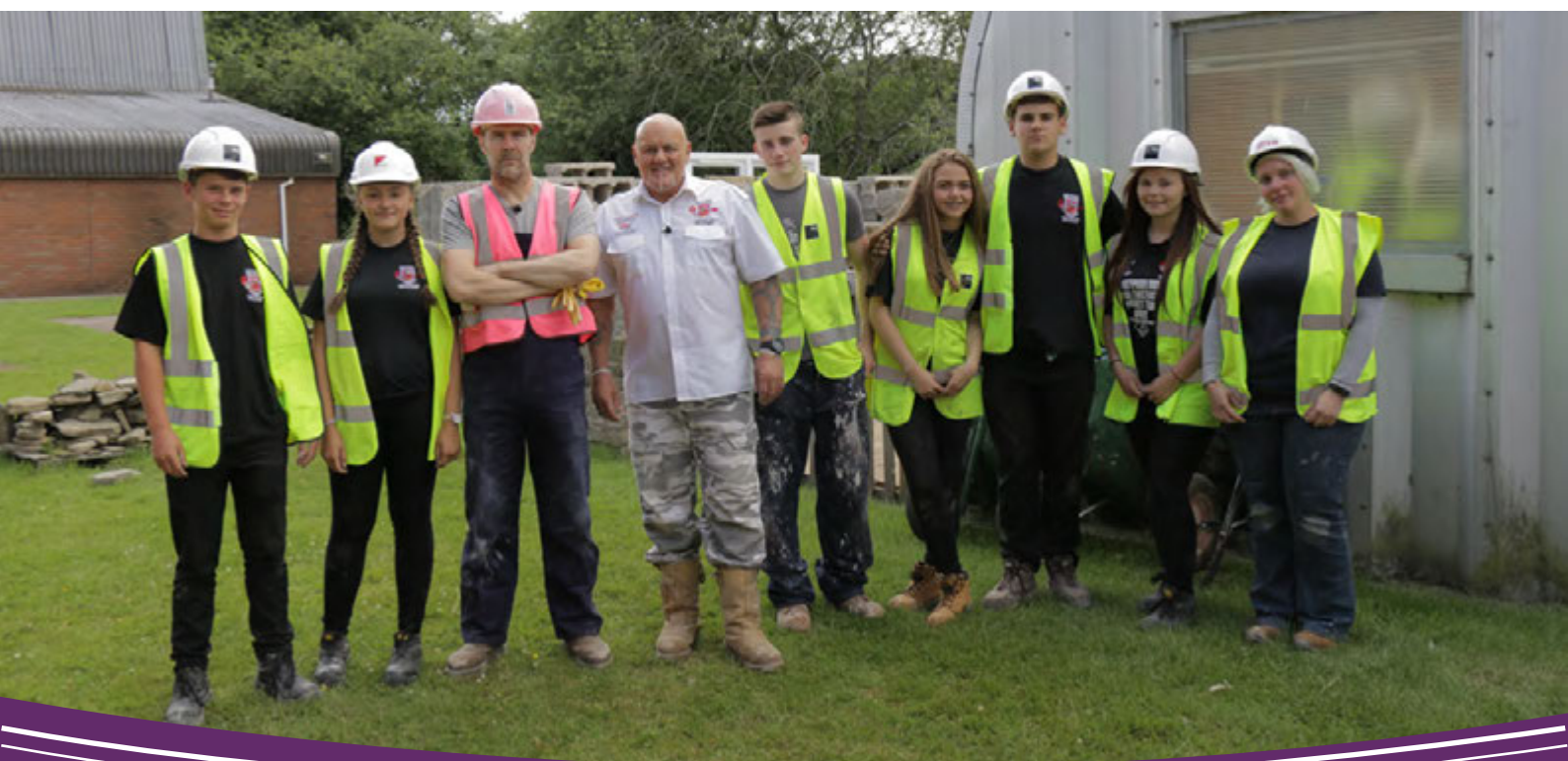
Image: Rhod Gilbert and the Construction team

The episode featuring our school will be airing on BBC One in March 2017 ■