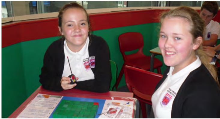
Image: Pupils having fun with maths challenges