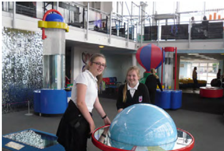
Image: Pupils enjoying the trip to Techniquest