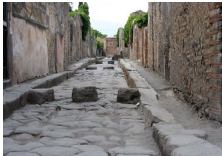
Image: Street in Pompeii