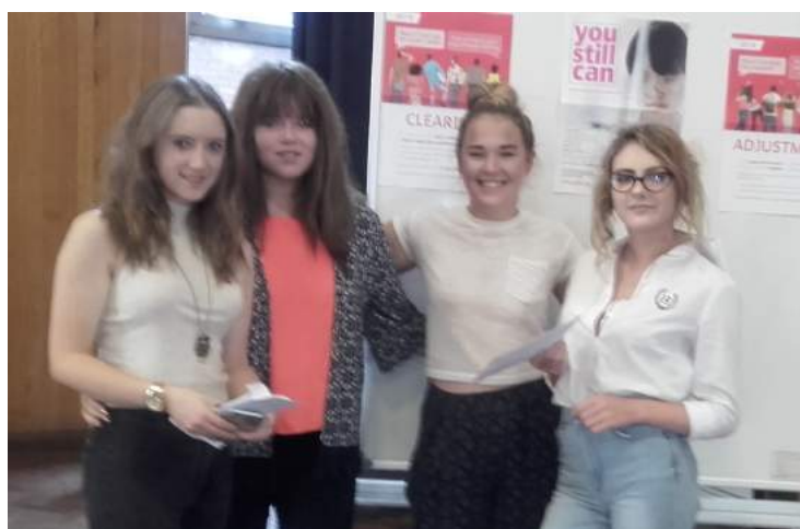
Image: Delighted students