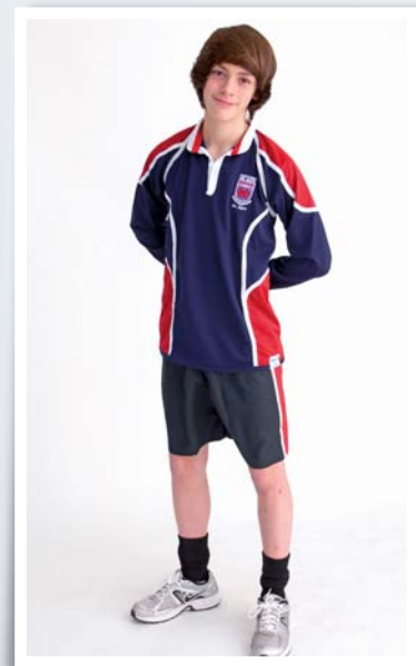
Rugby Jersey • Shorts Navy Socks