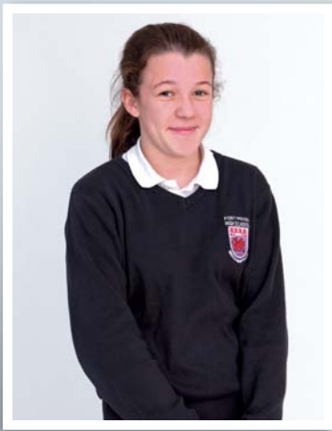
Yr 7 - 11 Jumper with Polo Shirt