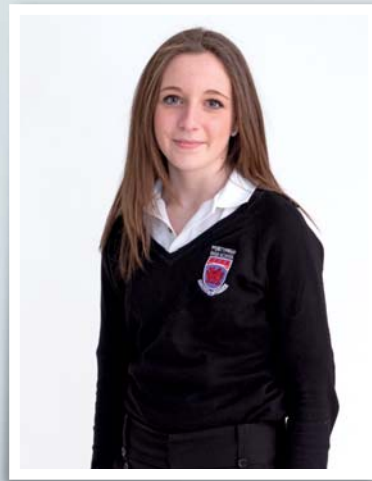
Yr 7 - 11 V neck Jumper with Polo Shirt