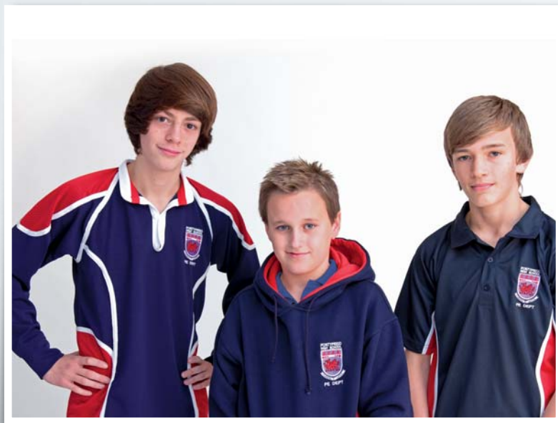
Rugby Jersey • PE Hooded Tracksuit Top • PE Polo Shirt