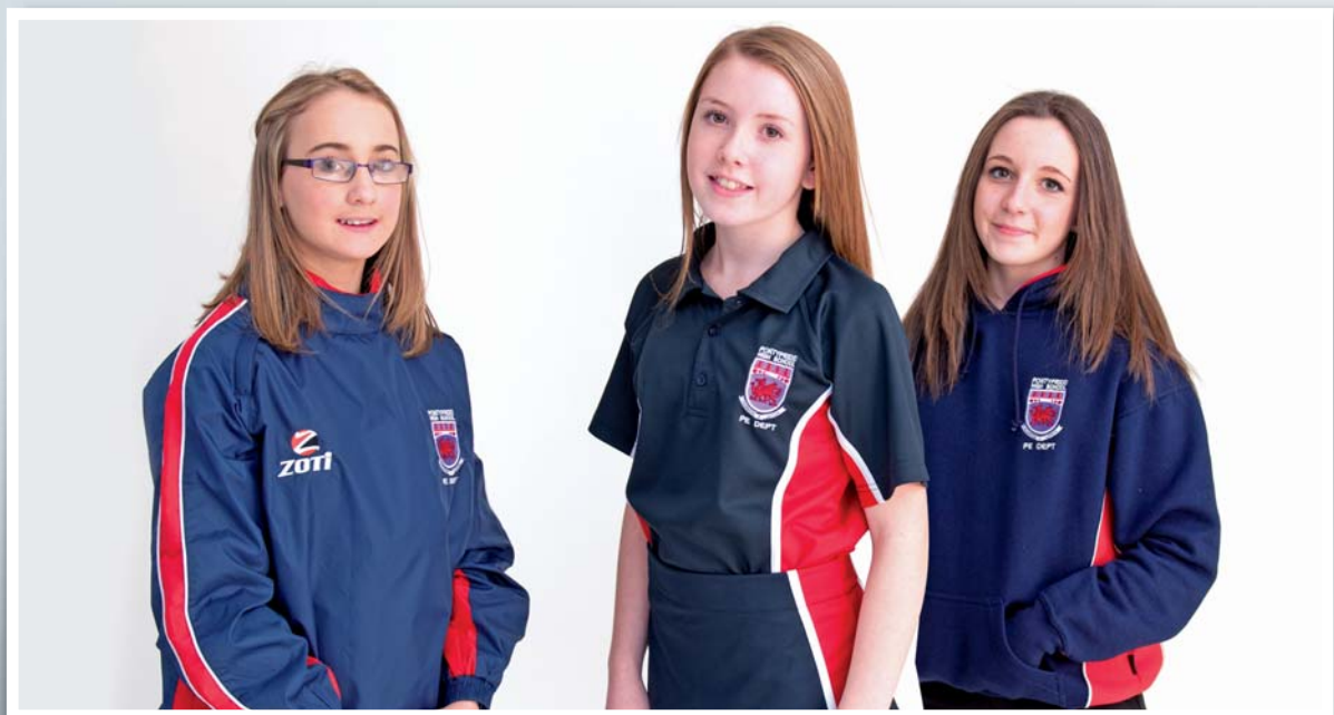
PE Training Top • PE Polo Shirt, PE Skort • PE Hooded Tracksuit Top

Hooded tracksuit top must have surname on the back and is for use in PE only All tops must have PHS badge • Please note: grey joggers are not acceptable