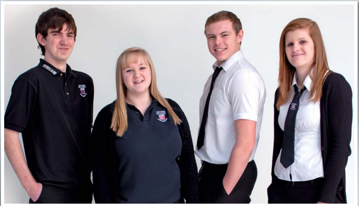
6th Form Polo Shirt • 6th Form Tie • 6th form Cardigan