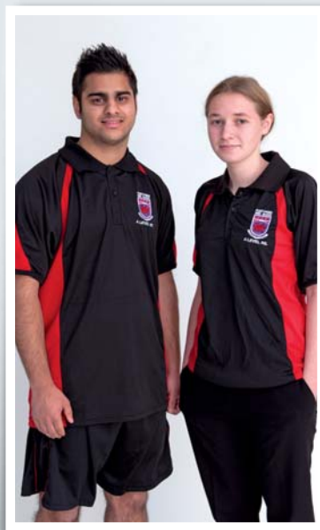
A Level PE Top • A Level PE Shorts Jogging Bottoms