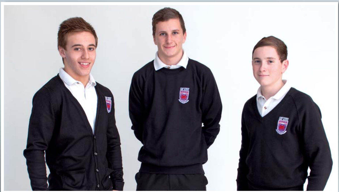
Yr 7 - 11 Cardigan • Round Neck Jumper • V Neck Jumper • School Polo Shirt

Shoes-plain, dark, flat shoes – no trainers Trousers – plain black in a suitably smart style – no jeans or denims • Skirt – MUST be knee length