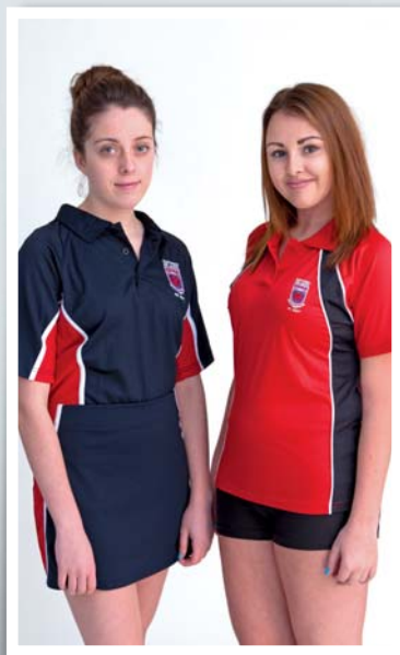
PE Polo Shirt PE Skort GSCCE Polo Shirt