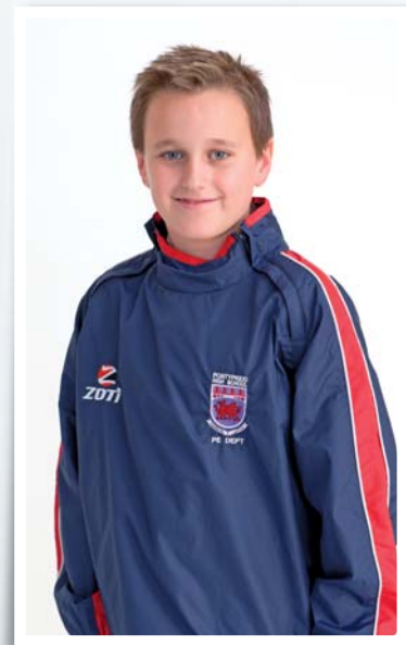
PE Training Top